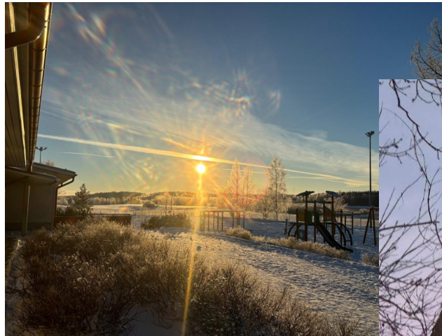
Sunrise in Helsinki ,Finland on January 11 at 8:05 am